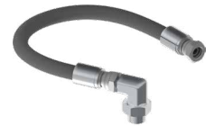
KIT DRAINAGE PLURY contre-pression MAX 15 BAR